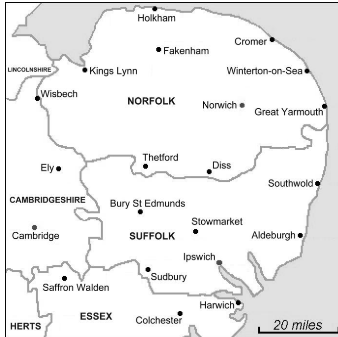
Figure 1: The coastline of Norfolk, UK. Holkham is situated in North Norfolk

rare species such as shrubby seablite ( Suaeda fruticosa ) and Jersey cudweed ( Gnaphalium luteoalbum ). It is one of only three dune systems in the UK where the natterjack toad ( Bufo calamita ) is present.