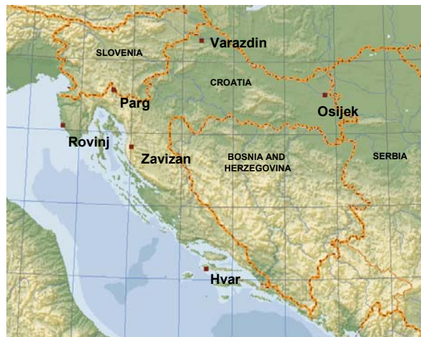
Figure 1: The position of analysed stations

The second part of the work here puts together a “presents a climatological leaflet” useful for tourism, based on the analysis of 10-day periods of meteorological parameters important for tourism and recreation. The selection of meteorological parameters used here takes into account the thermal, physical and aesthetic components relevant for tourists.